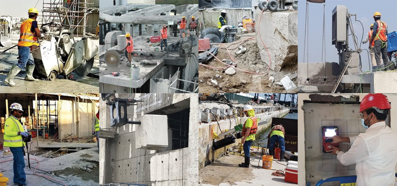
PHOTO GALLERY WORKSITE PHOTOS

You'll get to know why we're the preferred choice in your area when it comes to providing quality concrete cutting services.